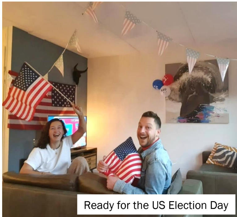
Ready for the US Election Day