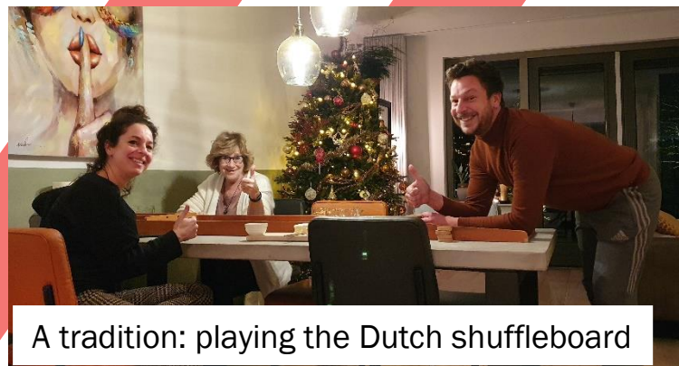
A tradition: playing the Dutch shuffleboard