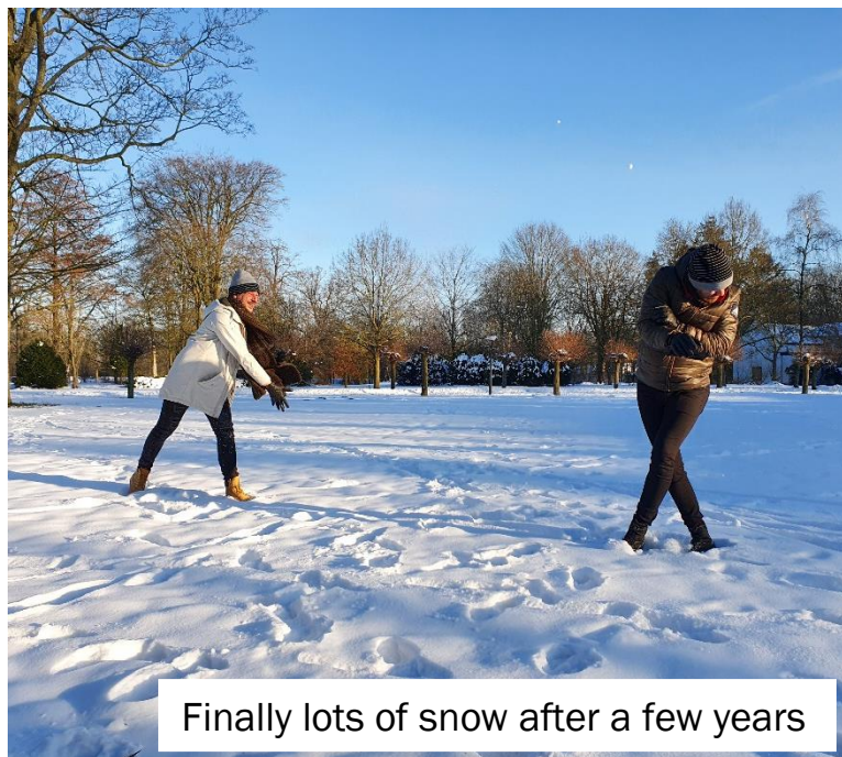
Finally lots of snow after a few years