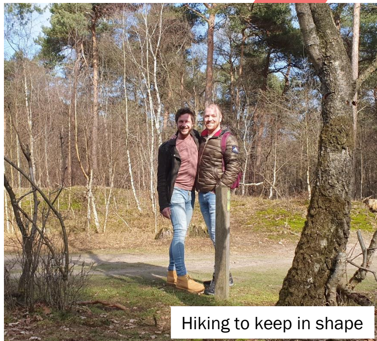
Hiking to keep in shape