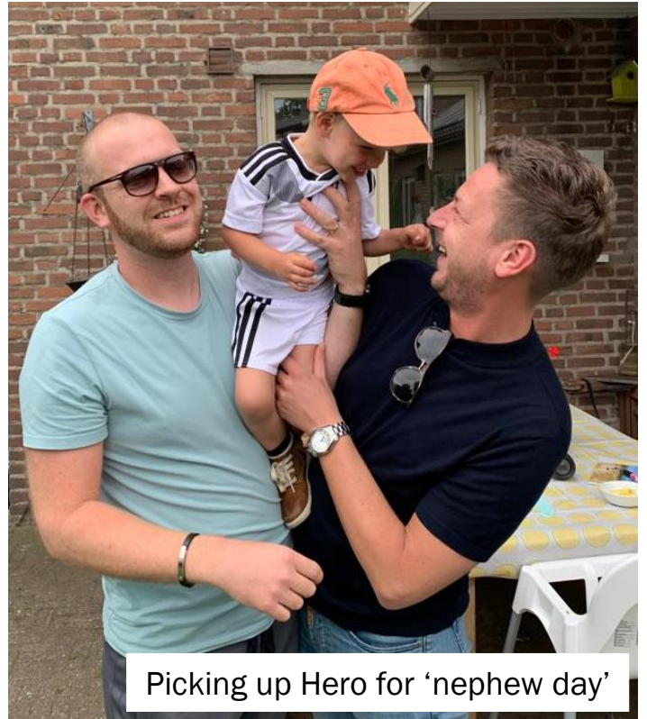
Picking up Hero for 'nephew day'